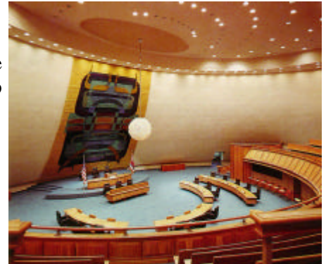
The Senate chamber, lit by the chandelier 'Moon'.

If you would like to learn more about the capitol, please contact my office for a tour! This is the building of the people of Hawaii. You are always welcome here.